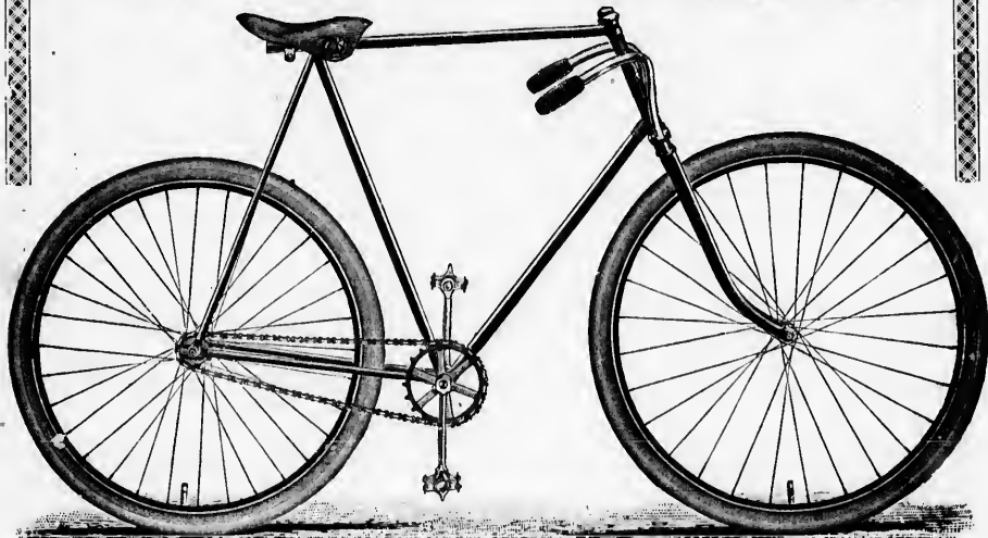
SMALLEY'S TRACK RACER—19 Pounds.

W. MANN & CO., 397 to 403 Clarence Street.