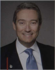
The Honourable François-Philippe Champagne