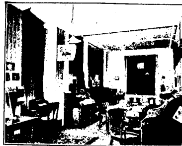
EFFECT IN DEEP OFFICE

is as far ahead of the ordinary flat back prism as the electric bulb is of the tallow dip of a bygone age.