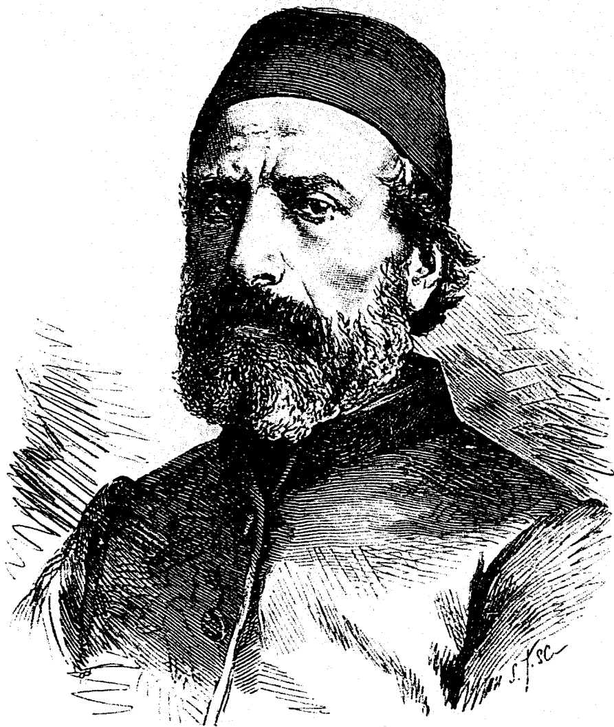
EDHEM PASHA, THE NEW GRAND VIZIER OF TURKEY.