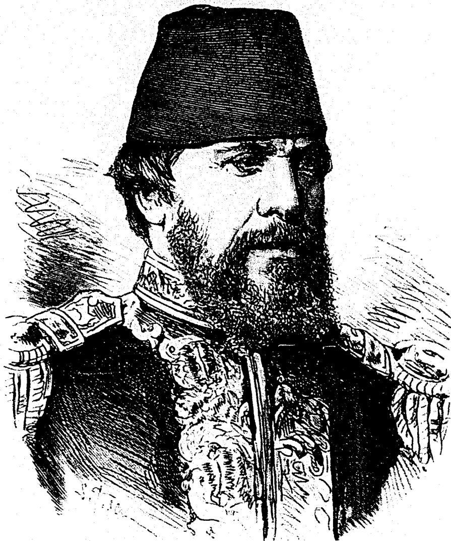
HOBART PASHA, THE COMMANDER-IN-CHIEF OF THE TURKISH NAVY.