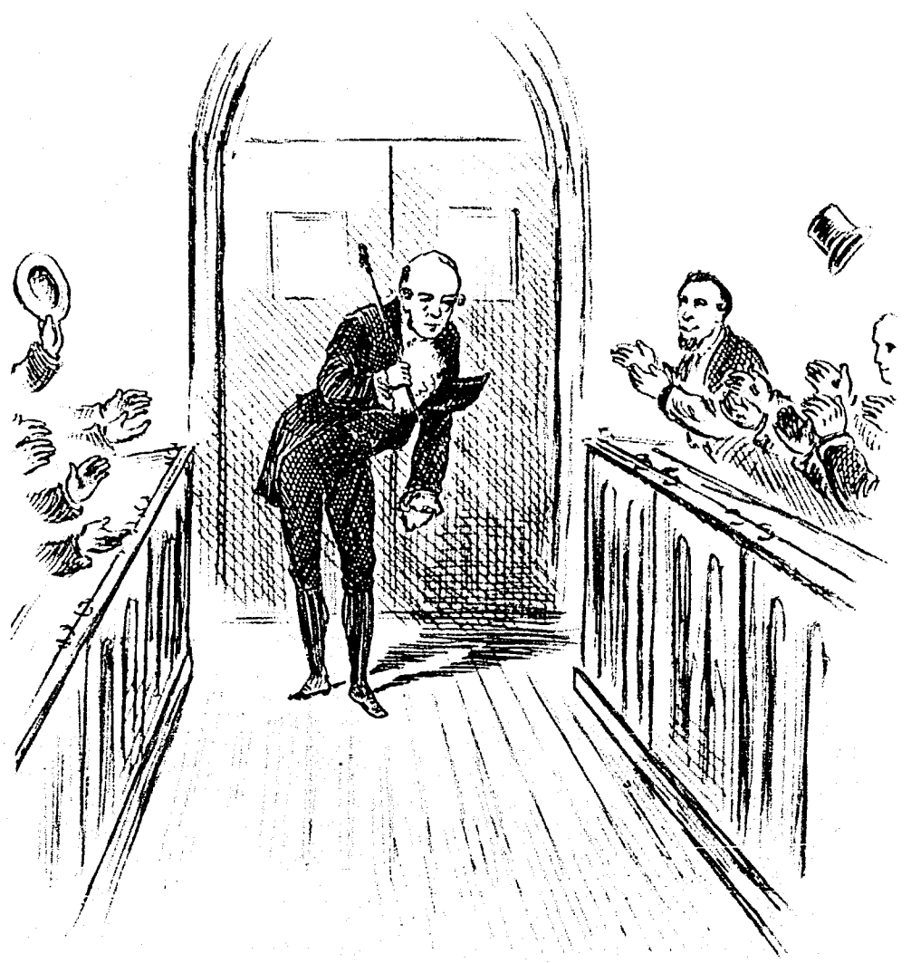
BLACK ROD INVITING THE ATTENDANCE OF THE COMMONS.

THE SESSION. No. IV.—SCENES AT THE OPENING.—By E. JUMP.