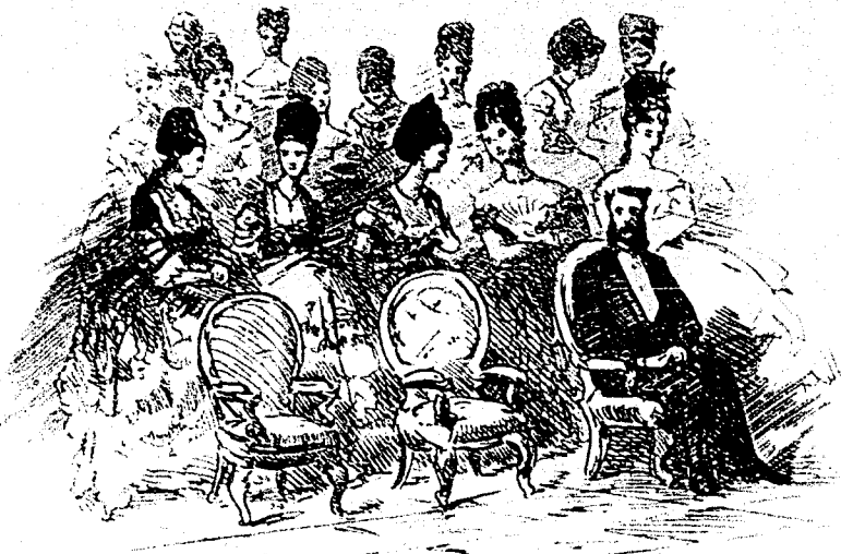
WAITING FOR LADY DUFFERIN.