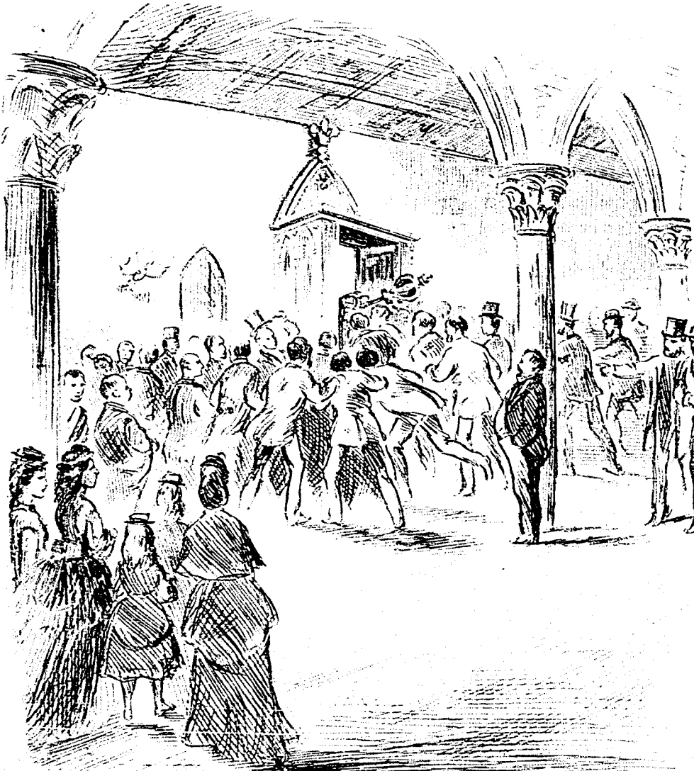
THE RUSH TO THE SENATE CHAMBER.