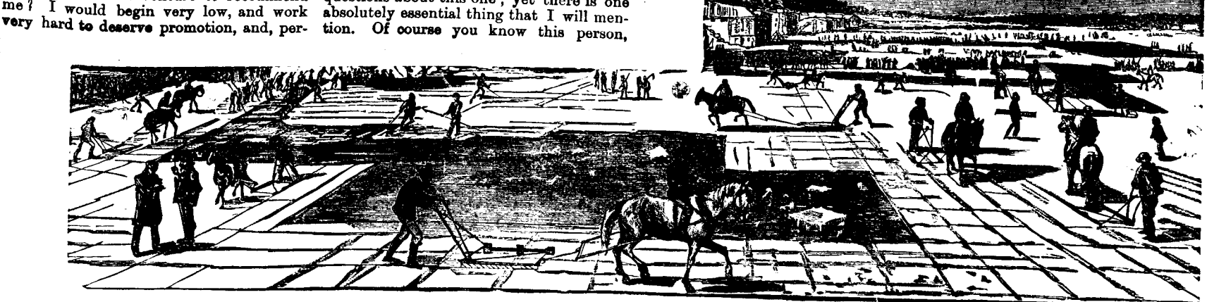
THE ICE HARVEST.

A LITTLE boy, who came before the pastor to be received into the Church, was asked how he expected into the Church, was asked how he expected to lead a Christian life, and he sweetly replied : "I will put my hand in Jesus' hand, and I know he will lead me right."