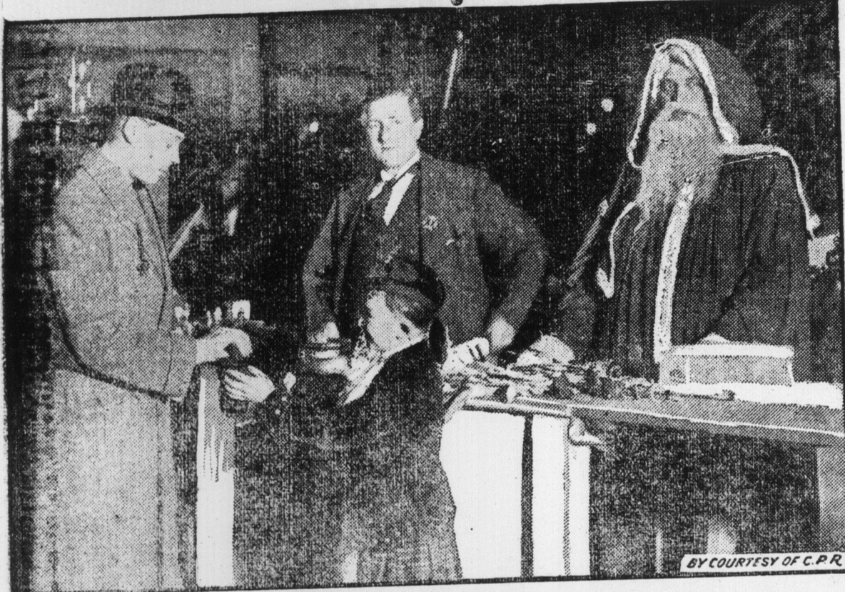
The Prince of Wales at the Ex-Service Men's Exhibition receiving his prize (a pair of boots) at the Lucky Tub from a dwarf dressed as a Scotchman.