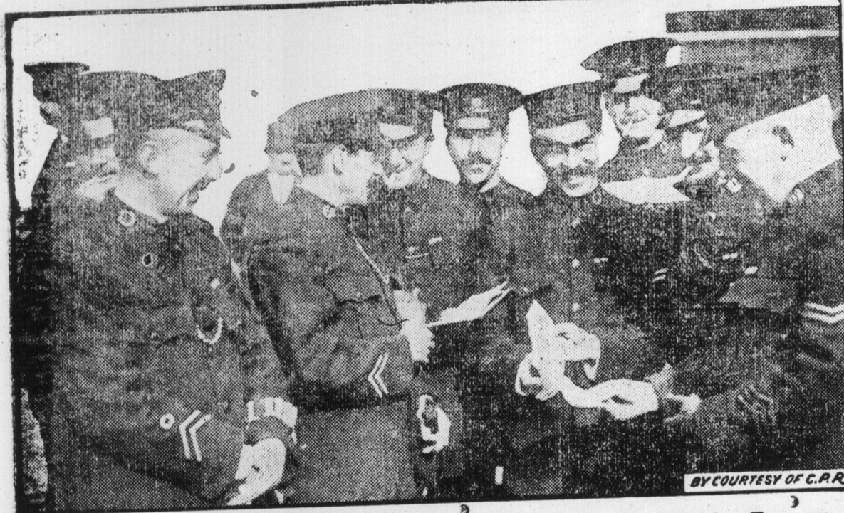
The highest reward a city can give. The Freedom of the City of London, Eng., presented to members of Special Constabulary for services rendered during the war.