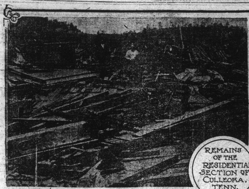
REMAINS OF THE RESIDENTIAL SECTION OF COLLECKA, TENN.

ASHDOWN'S Quality Hardware. Quick Service