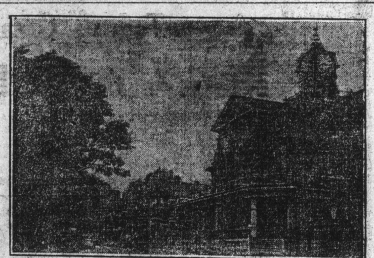
DELAWARE, INDIANA.—The first place to feel the awful effects of the deluge and tell it to the world.

Chicago, April 1.—Marriage, death or an immoral life are the only avenues of escape for girls from the toll of the "sweat shops," according to the testimony of witnesses before the Illinois vice commission, which resumed its inquiry today. Lieutenant Governor O'Hara, chairman of the commission, devoted much time to examining girls and women from the west side "sweat shops," where wages range from $2.50 to $5.00 a week. Lieutenant Governor O'Hara agreed with Senator Judd to give one dollar each to "sweat shop" witnesses, because it was believed they would be "docked" by the employers for the time spent before the commission. The moral obligation of the employers to make certain that their employees are properly clothed and adequately nourished was emphasized throughout the session. Sergeant-at-Arms T. B. Scouten and M. B. Coan, investigator for the commission, today seized the books of Rosewald and Wall clothing manufacturers, who failed to respond to subpoenas to appear before the commission.