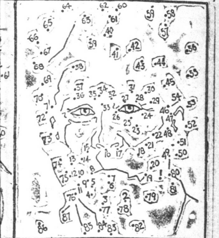
DONT BE SORE RIBBER (trace from 1 to 87)

A FEW NAMES OF GREAT MEN LIVING TO-DAY: Lord Reading, Marshal Foch, Andrew Bonar-Law, Herbert C. Hoover, G. H. Roberts, H. G. Wells, Woodrow Wilson, Georges Clemenceau, David Lloyd George, Samuel Gompers, Lord Robert Cecil, Sir Eric Geddes, Sir Robert Borden, Vittorio Orlando, Thomas A. Edison, Sir David Beatty, Col. William Avery Bishop, Ignace Paderewski, General Jan C. Smuts, General Louis Botha, E. K. Venizelos, General Sir Arthur Currie, etc.