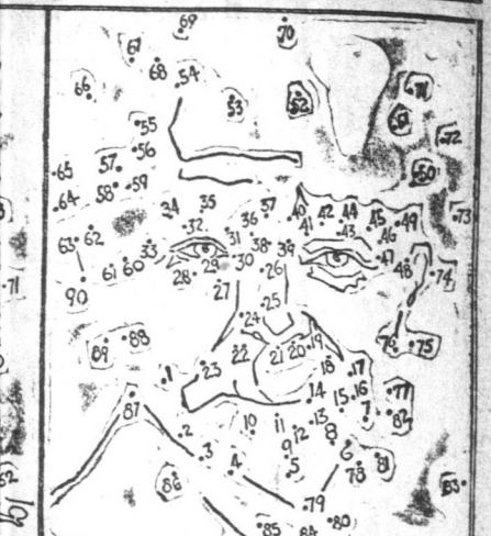
GO VALID GLORY DEED (trace from 1 to 80)