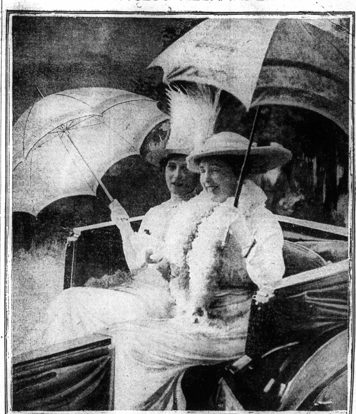
H. R. H. PRINCESS MARY FROM THE MOST RECENT CAMERA PORTRAIT. This photograph of H. R. H. Princess Mary, who is seventeen years of age, was taken as she was driving recently from Windsor Castle to Eton with Princess Alexander of Teck.

formerly handled, and that their capacity to remit to Peking on general account is thereby diminished.