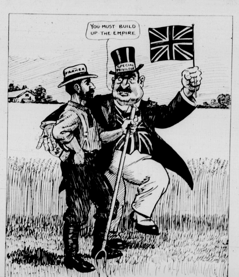
How Trade Follows the Flag

Montreal, July 29.-The gross earn-ings of the Canadian Pacific for the fiscal year ended June 30, were: $104,-167,808, or slightly larger than the esti-mates. The net profits for the year were: $38,699,830. The increase in net profits for the year is $2,859,874. These are, of course, new high records, but will be eclipsed this year with the re-cord crop, when the C.P.R. should take in over $110,000,000. Owing to the increase in the capital, the C.P.R.'s earn-