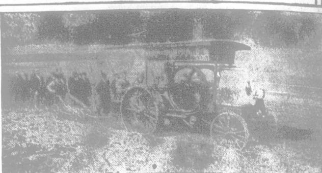
CROWD FOLLOWING THE WINNER

The unspoken argument to farmers in all these victories is to show that when they buy an International tractor they can know positively that it will do the work for which a farm tractor is made. The tractors winning these prizes are not "de luxe" engines, built especially for these contests. They are every-day stock engines, such as you would buy for your own use. The reason for this superiority lies in the material and care used in their construction and in the scientific skill of their design. The International Harvester Company of America did not enter these contests. They are every-day stock engines, such as you would buy for your own use. The reason for this superiority lies in the material and care used in their construction and in the scientific skill of their design. competitions for the sake of winning prizes, nor did it enter them for the advertising to be secured. It was a simple business proposition to convince prospective buyers that the International tractor is the leader in its class, and that it will save more labor of men and horses and can be run cheaper