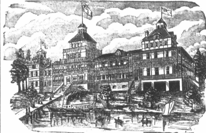
"THE PENETANGUSHENE" HOTEL.

Canada's Summer Holiday Grounds. Home of the Black Bass and Other Game Fish.