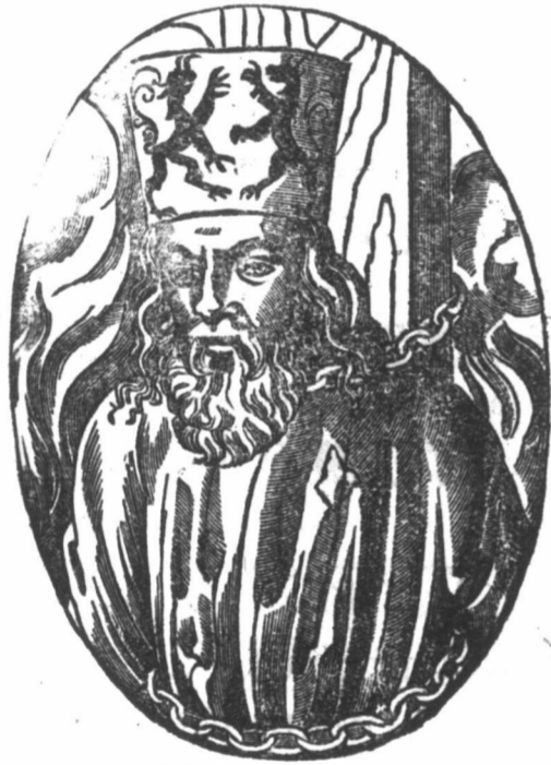
JEROME OF PRAGUE.

HALLAM'S HISTORY of the MIDDLE AGES. Complete, with all the Notes,