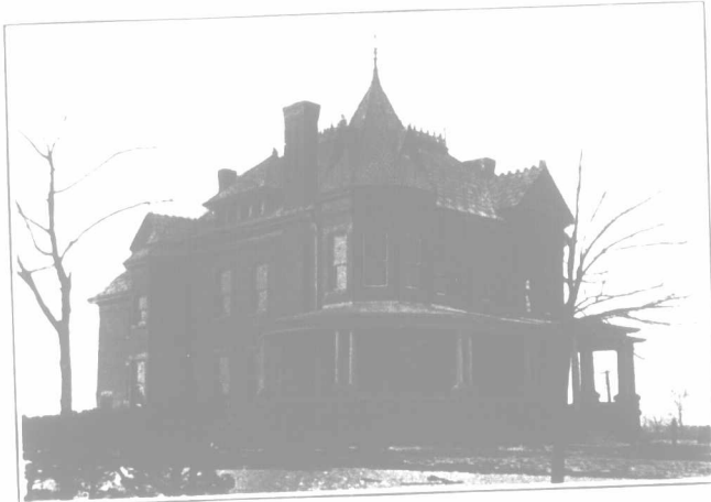
"This cut illustrates a handsome residence at Port Colborne, Ontario, roofed with "Safe Lock" Shingles. It shows the possibilities of this roofing material on a badly cut-up surface."

"SAFE LOCK" SHINGLES ARE DURABLE.—Being made of the best material, our "Safe Lock" Galvanized Shingles will last from twenty-five to one hundred years. The earliest shingles which we sold over ten years ago, are still as good as new. Read below what is said of them by responsible farmers who know.