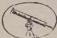
Registered Trade Mark.

Locks in all qualities for Cabinet Makers, Cash Fasteners, Locks & Brassfoundry for Builders' Ironmonger. ALL KINDS OF KEYS MADE on the PREMISES.