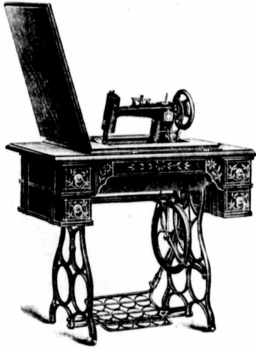
Cabinet No. 1

If your husband could buy a thoroughly up-to-date binder at half price, how long would he put up with the old worn out one? If you think you can secure us one or two new subscribers for the FARMING WORLD write us. We'll make you a tempting offer.