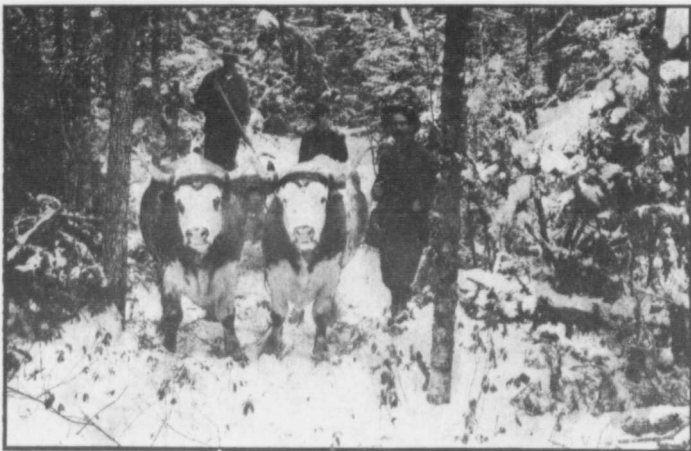
In the lumbering operations of Nova Scotia, oxen are frequently used to haul logs out of the bush.