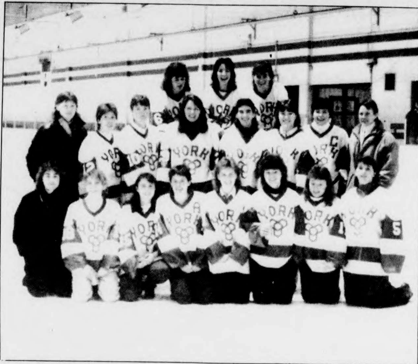
DRAGGED FROM THE SHOWER . . . The hockey Yeowomen kick back at the Ice Palace after tying a strong Queen's squad on Saturday.

Moran also pointed out that she doesn't feel that the team's 2-4-2