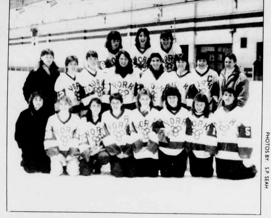
DRAGGED FROM THE SHOWER . . . The hockey Yeowomen kick back at the Ice Palace after tying a strong Queen's squad on Saturday.

Moran also pointed out that she doesn't feel that the team's 2-4-2