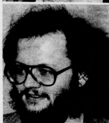
It's your choice on March 9 and 10.