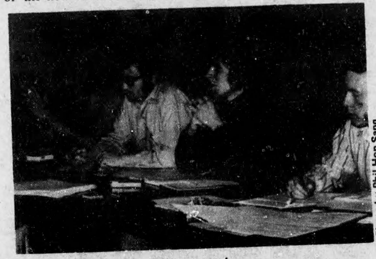
Let us pray!