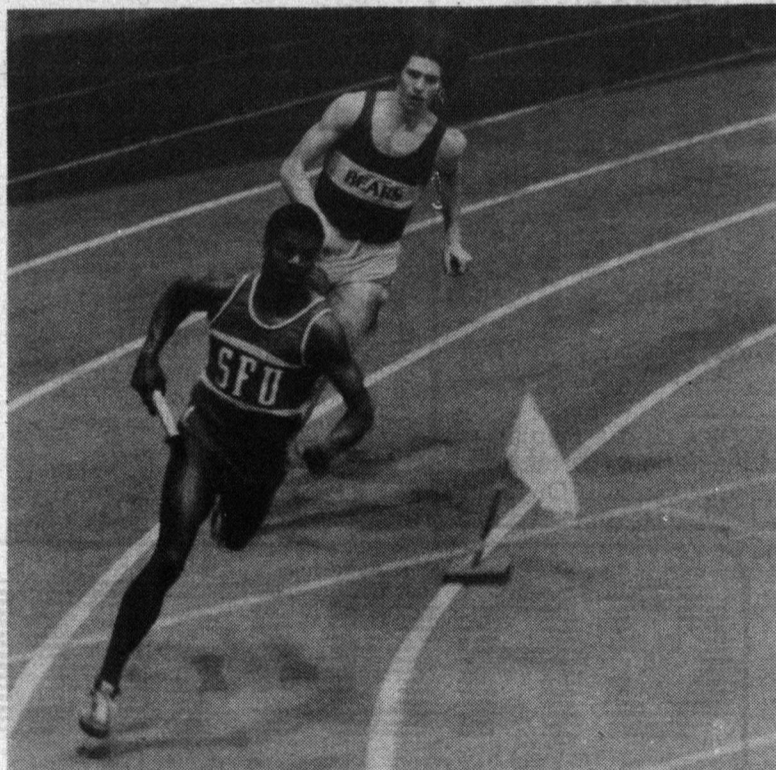
SFU leads relay

The Bears and Pandas will compete next weekend at the Kinsmen Field House in the Alberta age class meet.