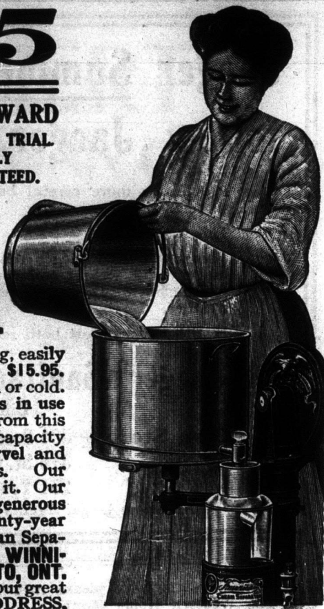
BOX 1196, BAINBRIDGE, N. Y.

AMERICAN SEPARATOR CO., BAINBRIDGE, N. Y.