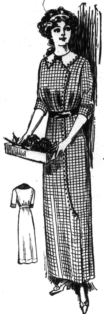
DESIGN BY MAY MANTON. 7385 Belted Semi-Princesse Dress for Misses and Small Women, 14, 16 and 18 years.

dress, No. 7385, is cut in sizes for misses of 14, 16 and 18 years of age, of the scallops, No. 583, includes four yards. They will be mailed to any address by the Fashion Department of this paper on receipt of ten cents for each.