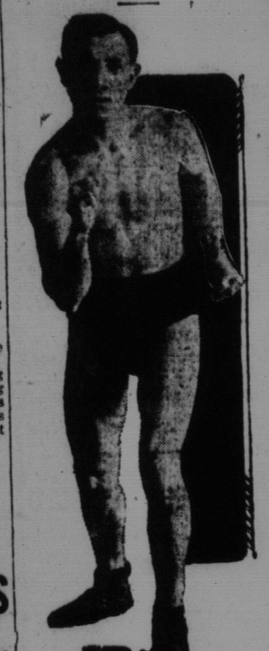
ABE ATTEL, Present Featherweight Champion, Who Will Fight Johnnie Kilbane on Feb. 22nd.