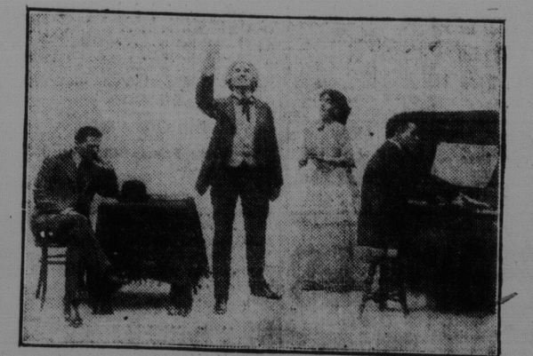
THE CLIMAX—Scene from Act 3.