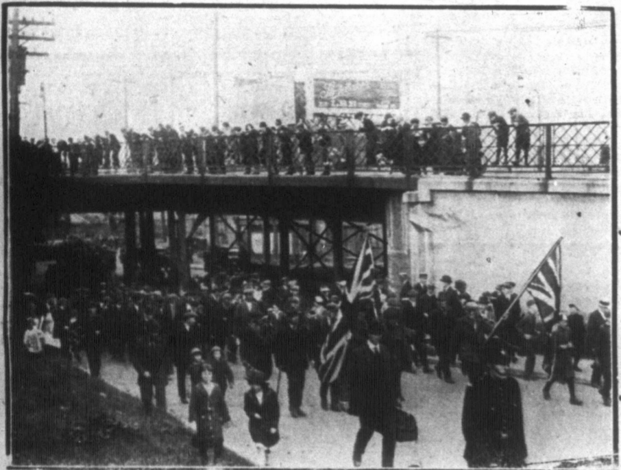
The return of the hikers to Toronto.