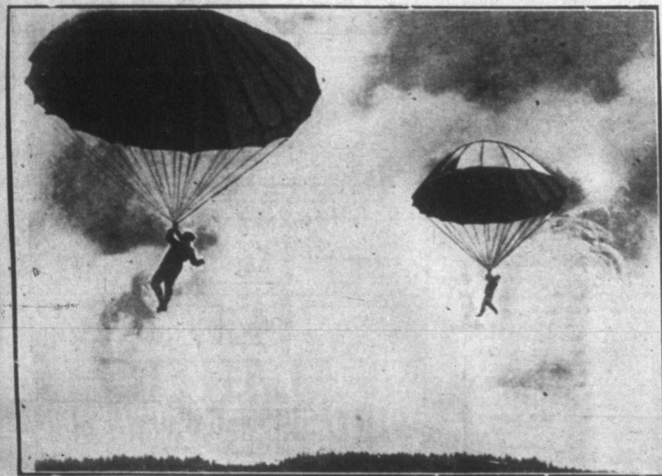
There are chases in German movies, too—this time in parachutes.