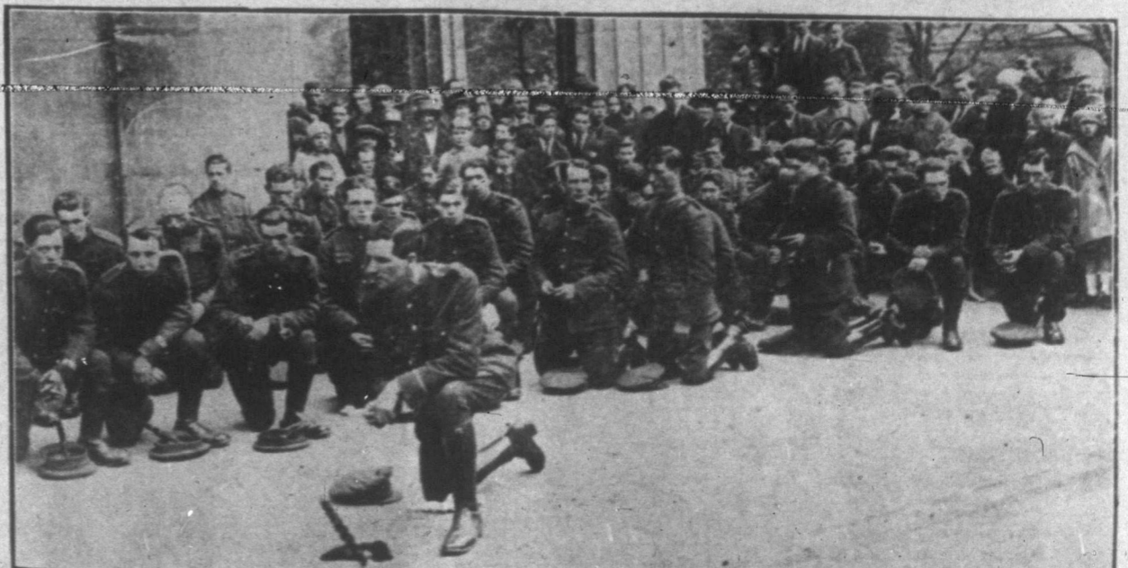
A solemn military requiem the first of its kind in Ireland, was celebrated recently in Dublin for a number of Irish Republican army men killed in action during the attack on the custom house. Photograph shows Free State soldiers praying outside the cathedral.