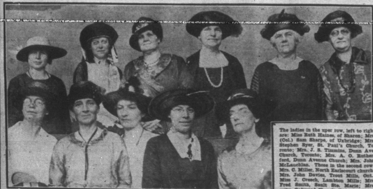
Methodists admit women to the floor of conference.