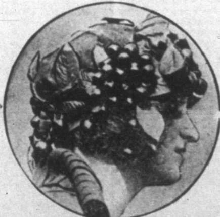
England's latest word in millinery. The hat trimmings are pinned to the hair.