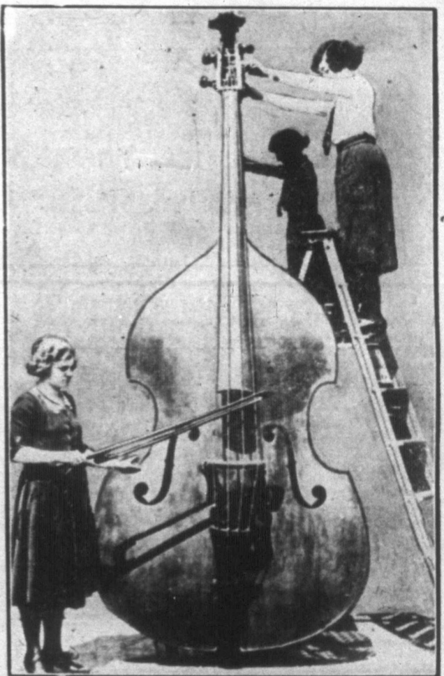
This giant violin, exhibited at a music conference in New York this week, weighs 150 pounds and is 11 feet 7 inches high. The strings are as thick as a man's finger, and the bow is 30 inches long.