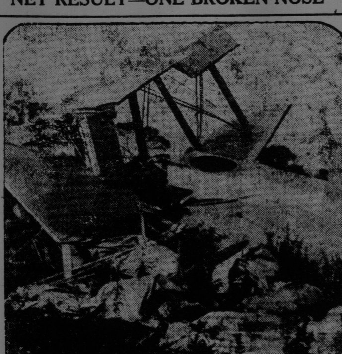
This navy plane was completely wrecked in a crash at Plainfield, N. J., but its pilot escaped with only a broken nose. He was flying from Hampton Roads, Va., to Mitchell Field, L. I.