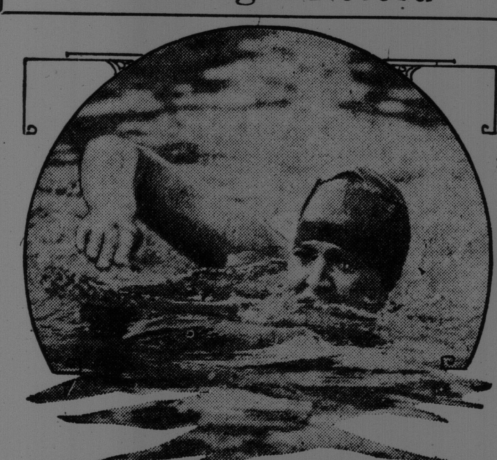
From New York's Battery to Sandy Hook, a distance of 21 miles, 17-year-old Gertrude Ederle just swam for a new record, covering the distance in 7 hours 11½ minutes. The old record, set by a man, was 7