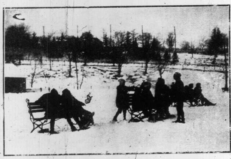
RACE FOR FIRST PLACE AT RIVERDALE RINK. Boys fasting on their skates preparatory to good two hours' fun on the ice.

NEXT WEEK LAST SEASON'S BIG MUSICAL SUCCESS "THE RED MOON" PRESENTING THE WORLD'S GREATEST COLORED COMEDIANS COLE & JOHNSON