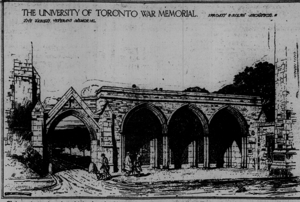
oistered arcade to be subjoined to the University of Toronto Memorial Tower, and to house the names of the alumni or members of the University who fell in the War. This is being erected by the returned graduates and undergraduates of the University at a cost of $25,000. Cloistered arcade to be sub