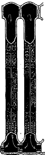
Sectional View of Hot Water Radiator Showing Form of Connection.