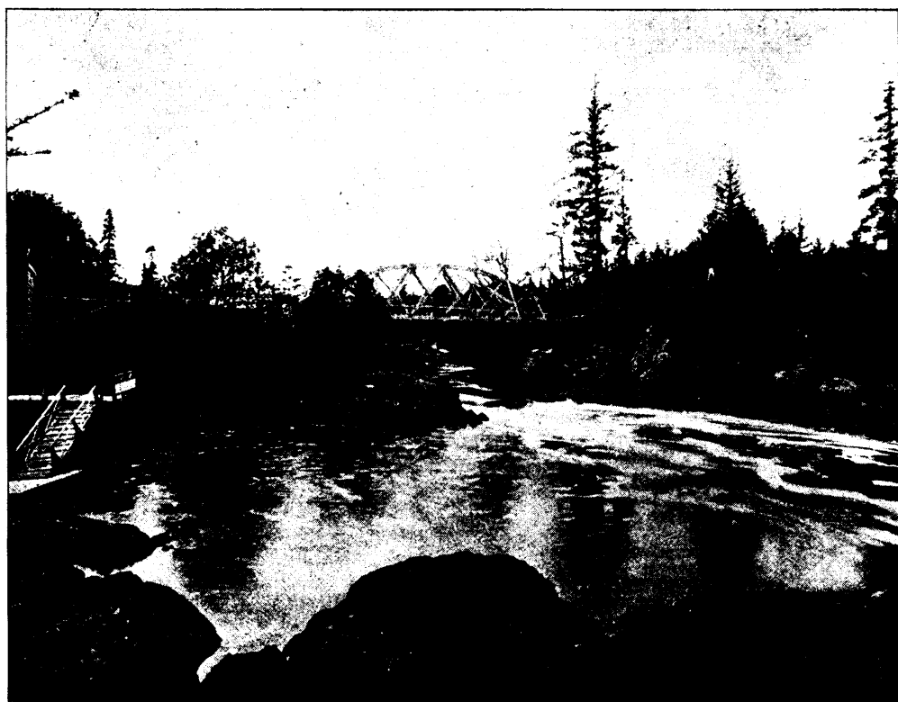
THE GORGE, VICTORIA ARM. SCENES IN VICTORIA, B. C.