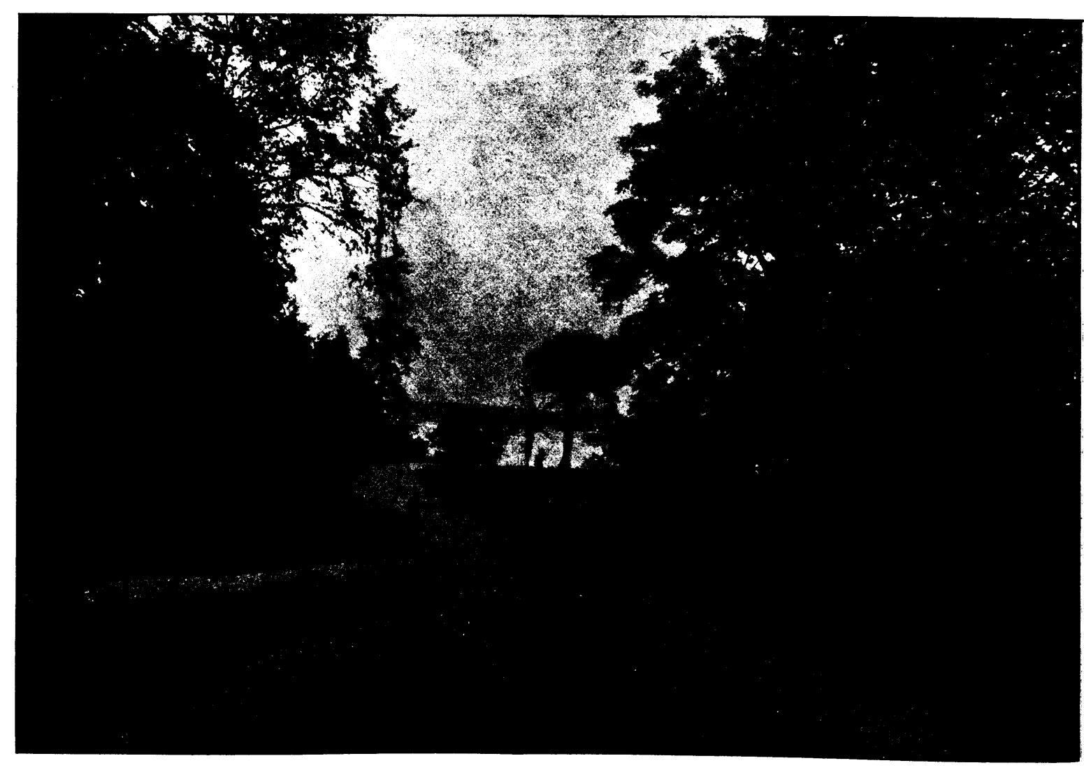
ON ISLE DORVAL, LAKE ST. LOUIS, TEN MILES ABOVE MONTREAL; property of the late Sir George Simpson.