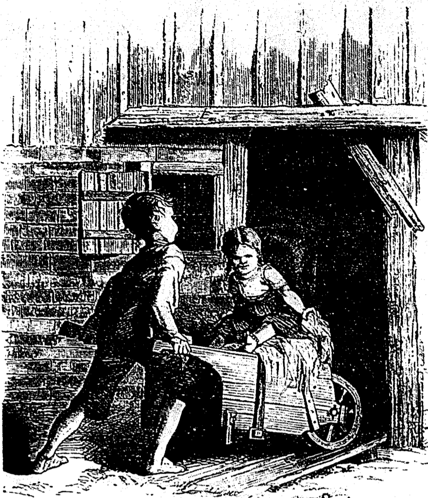
OUR COUNTRY COACH.