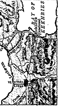
BAY OF KENCHIRIES

Longitude East 25 30 35 40 45 50 55 60 65 70 75 80 85 90