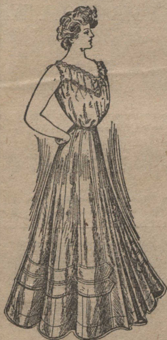
N.M. 80. — A dressy Skirt of bright lustre, in black, navy, and cream, cut very full with ripple flare sides, and pleated front and back, trimmed with folds of self. The price will create quick selling $5.00

Money refunded if goods are not satisfactory.