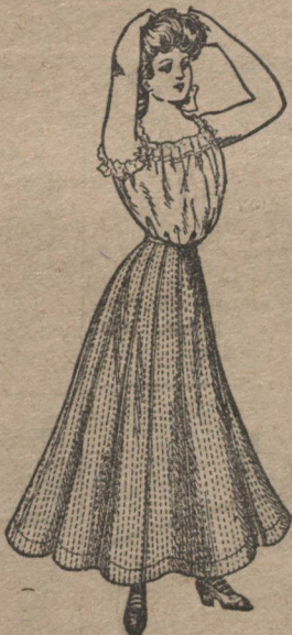
N.M. 81.—Misses' Tweed Skirt, thirteen-gore flare style, in light and mid-grey stripe effects, sizes 22-28 in. waistbands and 28-37 in lengths, unquestionable value . . . . . $2.75