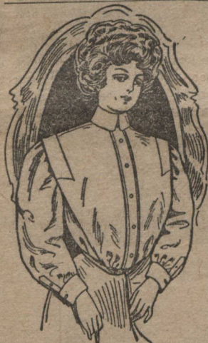
N.M. 85.—Ladies' White Pure Linen Shirtwaist, Gibson style, wide shoulder effect given by two extra wide stitched pleats over shoulders and down back to waist shirt sleeves with link cuffs, laundered collar, button front. A very fashionable waist for spring and summer wear. Sizes 32 to 44 bust measure. Special $2.50 value, each . . . . .