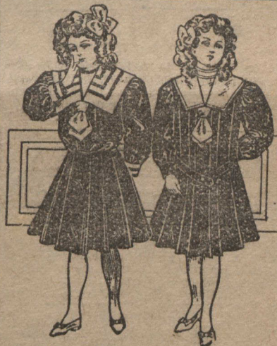
N.M. 89.—These perfect fitting fine quality Dresses come in fine navy blue print, with small white dot, white pique collar and tie. No. 19 has blouse and kilted and gathered skirt. No. 18 has box pleats front and back. Sizes for girls 6, 8, 10, 12 and 14 years. Dresses are exactly like $1.25 cuts. Special Value . . . . .

A 20-year guarantee in the back of every watch.