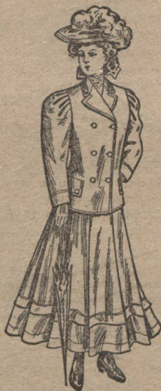
N.M. 82.—Misses' French Venetian Suit in brown, green, navy, Prince Chap double-breasted coat, mercerized lining, trimmed with brass buttons, nine-gore pleated skirt, trimmed with fold of self. sizes 30-34 bust, skirts up to 36 inch lengths unequalled value. . . . $10.00