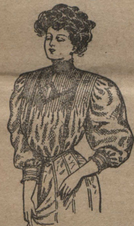
N.M. 86.—Waist of Fine White-Net, Japanese silk lining throughout, baby back, front made with pane effect of pin tucks fine insert flon and wide tucks, dainty lace collar and cuffs, sizes 32 to 42. Special . . . . . $3.50

We recommend this Watch to our customers as it is exceptional value.