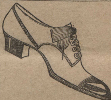
N.M. 90. — Ladies' New Spring Oxford, Blucher cut, fine dongola kid leather, patent toe caps, military and Cuban heels, all sizes 2½ to 7. Special . . . . . $1.49