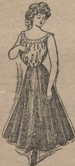
N.M. 83. — Serviceable Wash Skirt for Misses, made of heavy duck, in navy, cadet and white, flare style, cut quite full, sizes 22 to 28 inch bands and 28 to 37 in. lengths. Special . . . . . $1.50