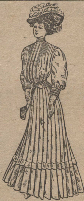
N.M. 84.—Lustre Shirtwaist Suit good bright quality, comes in black brown, navy, green and cream, waist made with front opening, back and front finished with box pleats and tucks, pleated skirt trimmed with fold of self, sizes up to 42 bust and 37-42 inch skirt lengths, incomparable value at. . . . . $5.00