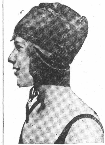
THE AIRCRAFT MODEL.

Designed like a pilot's cap is this bathing hood in red rubber with embossed pattern across the front piece