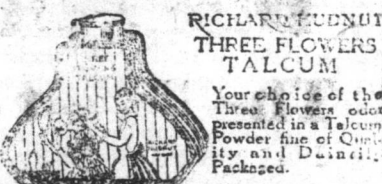
RICHARD HUDNUT THREE FLOWERS TALCUM Your choice of the Three Flowers talcum presented in a talcum Powder tin of Quality and Beauty. Packaged.