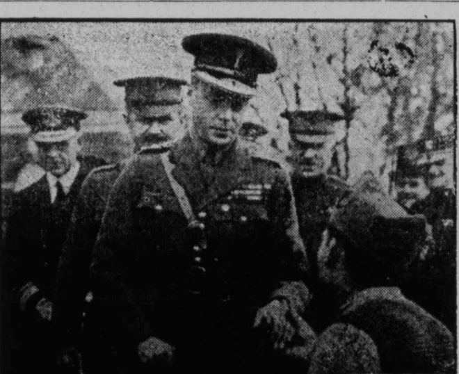
Prince Talks with Wounded Hero in Walter Reed Hospital,

Price 35c. At all Dealers and Druggists. Manufactured only by DOUGLAS & CO., NAPANEE, Ont.