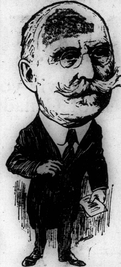
HON. T. CHASE CASGRAIN, Postmaster-General.

To British statesmen and Canadian statesmen the Empire has added Imperial statesman. Sir Robert Borden is the first Imperial statesman from the Overseas Dominions. He has seen the consummation of his prophecy and policy—Canada a partner instead of a ward of Great Britain.