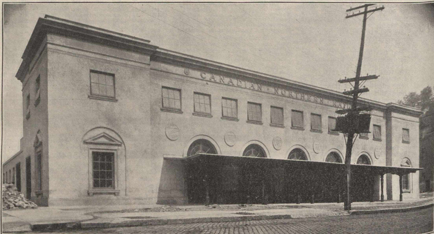
The Canadian Northern Railway's Temporary Station in Montreal, Lagachetiere St. front.

At its right descends a broad staircase, leading directly to the trains. There is also an entrance to the women's waiting room from the entrance vestibule and it contains space for telegraph office and news stand. The arrangement of the en-