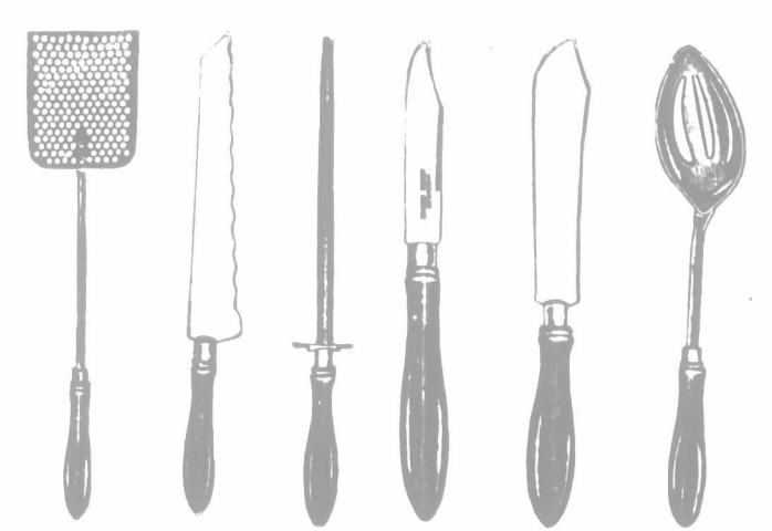
A COMPLETE KITCHEN EQUIPMENT. A UTENSIL FOR EVERY PUR-POSE. All made of the highest grade of crucible steel, carefully tempered, ground and polished by the latest improved process. Rubberoid finished hardwood handles, mounted with nickel-plated ferrules. Now is your opportunity to supply your kitchen with a complete cutlery outfit. All six articles sent to any subscriber for sending in only I strictly new subscription and $1.50.