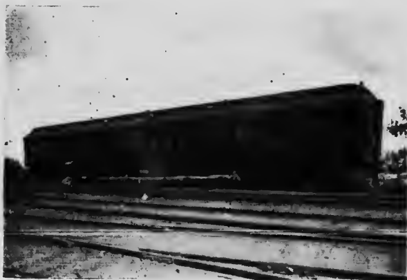
Pullman Sleeping Car.

The Pullman cars operated on this train are some of the finest that this well-known Company turns out. They are of the most modern type, and include drawing rooms and smoking rooms. The rooms have toilet facilities with hot and cold water. The bodies of the cars are beautifully finished, the woodwork being in the most costly material. The ceilings are exquisitely decorated, the upholstery and draperies being of the finest and in harmony with the finish.