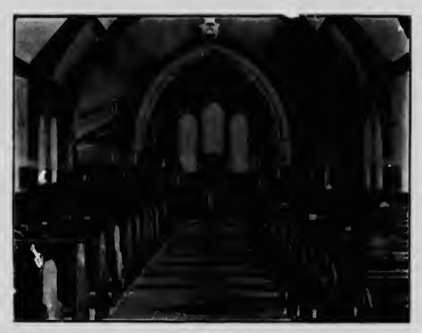
Interior of the Church.