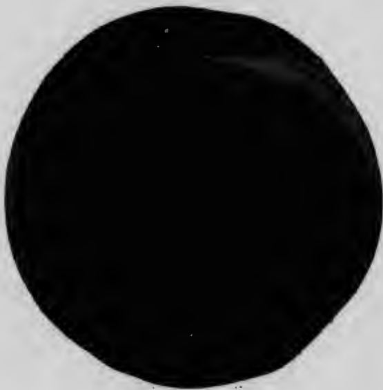
BRIGDON OR GARFIELD.

FLESH: yellow, free stone, texture tender, very juicy, flavor rich.