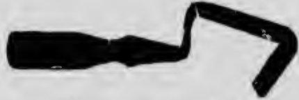
Hazeltine Hand Weeder