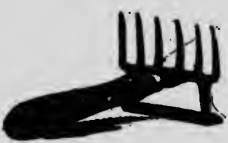
Combination Hand Weeder

Very troublesome in many small gardens are some of the tough-rooted grasses, but deep and thorough tillage may be depended upon to get rid of them. With the common weeds we must depend mostly on the hand and