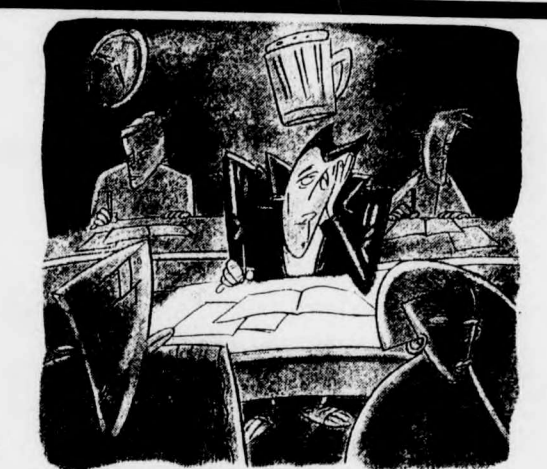
Not a creature of the day, the bat hangs out in musty libraries, avoiding the harsh light.

Drinking. What's It all about? There's nothing wrong with having a drink. You feel great. You're in control. But sometimes drinking can get you down.