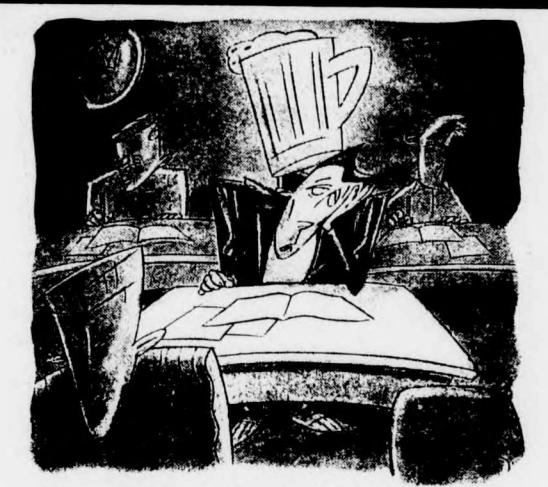
He will sleep for hours, his claws curled round the nearest object.

So how do you avoid graduating mugna cum laude? You could drink light beer or light wine. Or, if you like to have a glass in your hand, you could go for a non-