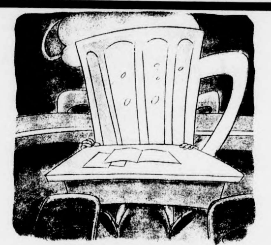
His days may be slow, but his nightlife is wild.

Stress can really get you down. But so can alcohol because it's a depressant. Truth is, talking to a friend or going for a workout could make you feel much better.