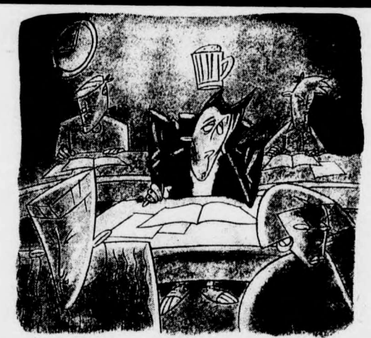
The bat is known for his small body, wide wings and pointed ears.