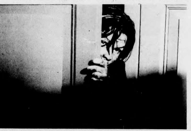
THE BOGEYMAN COMETH: from The Taste of Water.

Rather than make a film that blatantly criticizes the coldness of the social service, Seunke presents it in such a way that it comes to be an inevitable product of our society.