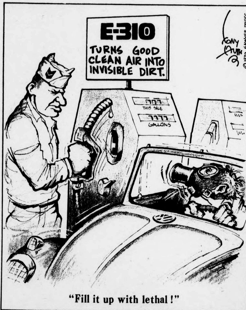
"Fill it up with lethal!"

excalibur, founded in 1966, is the student weekly of york university and is independent politically. opinions expressed are the writer's and those unsigned are the responsibility of the editor. excalibur is a member of canadian university press and liberation news service. printed at newsworld, excalibur circulates to over 17,000 people. office: central square (southeast corner) behind the ministry of love, york university, downsvew, ontario.